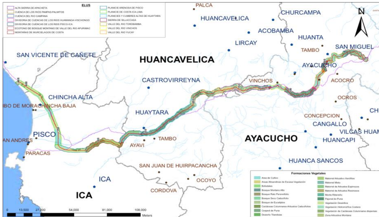
Figure 2 – Modified and improved “parallel route”

The evaluation results showed that the corridor with the fewest environmental and social impacts would be a modified and improved “parallel route”, as it would use some areas of the same corridor and much of the existing infrastructure (roads, yards, camps, etc.) as the gas pipeline that feeds Lima. After the modified and improved “parallel route” was selected, PLNG performed field work that permitted necessary changes (micro-routing) to minimize impacts. As a result, the route was modified and improved and the environmental and social impact assessment (ESIA) process began. The ESIA revisited the alternative analysis and assessed the optimized route to minimize river crossings, Andean wetland crossings, and archaeological site impacts.